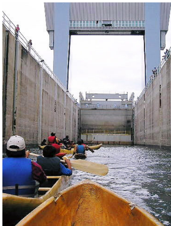
2006 Syilx Unity Trekk Canoe Journey